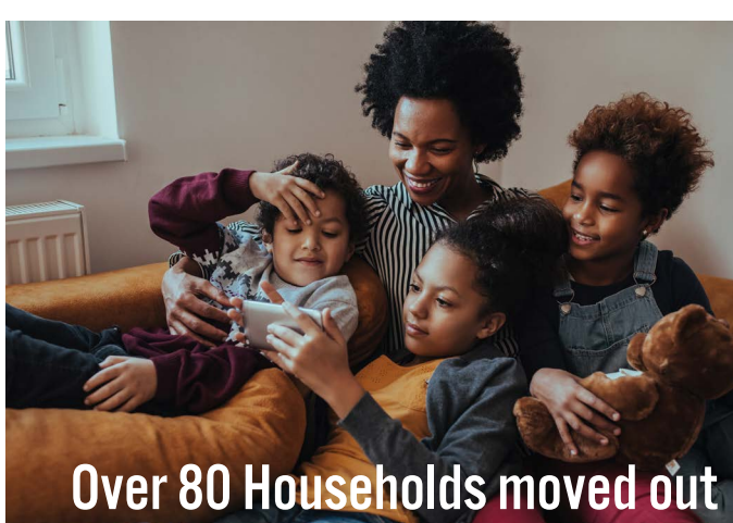
Over 80 Households moved out of Homelessness in 2021.

Now as the calendar has moved forward to 2022, we ask ourselves "What's next?" What will the new year bring? How can we rise to meet the challenges of the increasing needs and uncertainties in our community and in those we serve? It appears we will continue to face the effects and uncertainties of the pandemic. We will continue to embrace those experiencing grief, loss and hardship and see some of our loved ones suffering too.