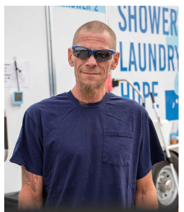
Outreaching the homeless through MAP.

with only one individual unable to maintain their new housing. A large part of the success of this program was credited to the aftercare case management follow up as formerly homeless individuals transitioned into their new life out of homelessness.